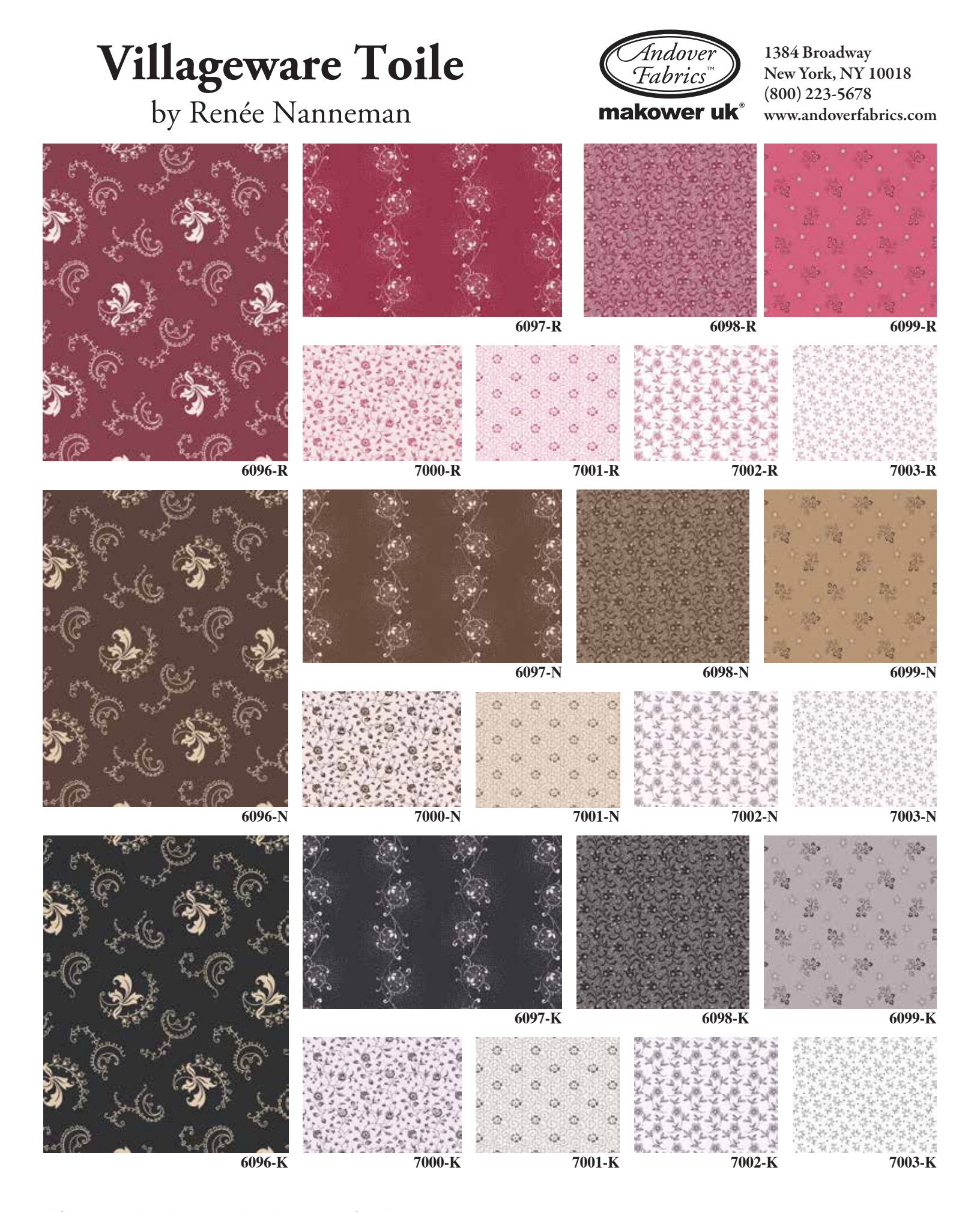
All fabrics are used in quilt pattern. Fabrics shown are 25% of actual size.